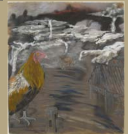
Efrain de Jesus