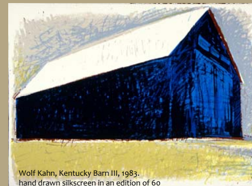
Wolf Kahn, Kentucky Barn III, 1983. hand drawn silkscreen in an edition of 60